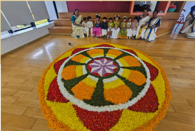
Athappookkalam at ELC Technopark

In Technopark Campus the festive spirit began days earlier as children and parents worked together on a grand Athappookkalam , setting a beautiful stage for the celebrations. The highlight of the day was a heartwarming Onam play presented by our Grade 2 students, followed by energetic dances, music, and even a graceful Thiruvathira by teachers and staff. Traditional games like uriyadi , vadamvali , and bun-biting filled the air with laughter, and the Onam Sadya brought everyone together around a feast of flavours.