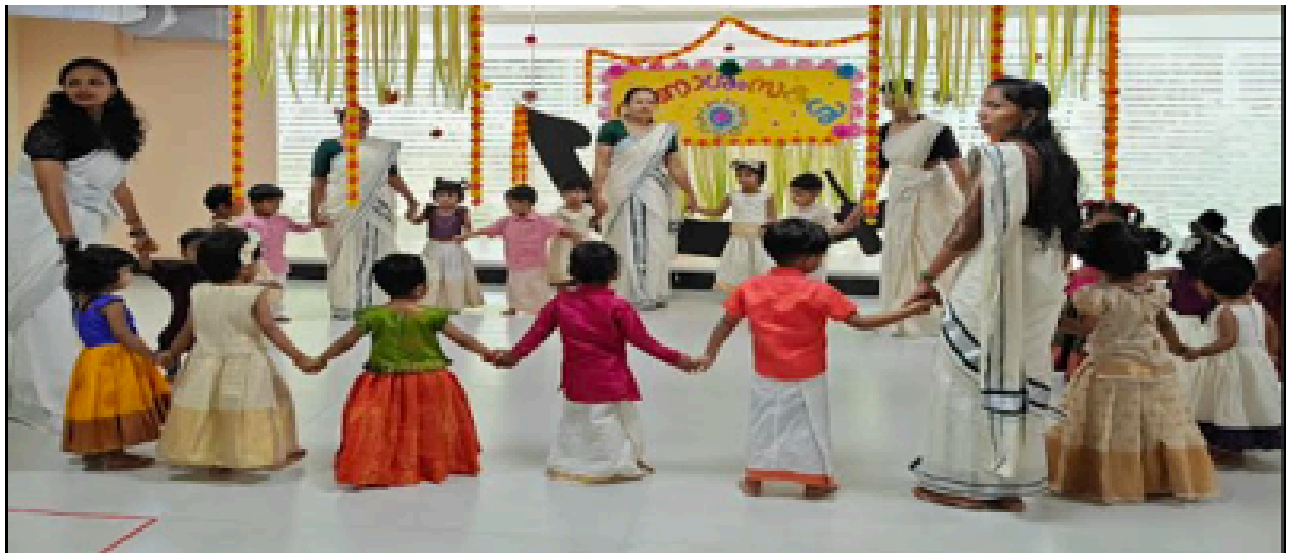
Thiruvathira (Folk song)

Across our ELC campuses , Onam was more than just a festival—it was a celebration of community, tradition, and joy. Most importantly, it gave our children the chance to experience the values of unity and togetherness that lie at the heart of Onam.