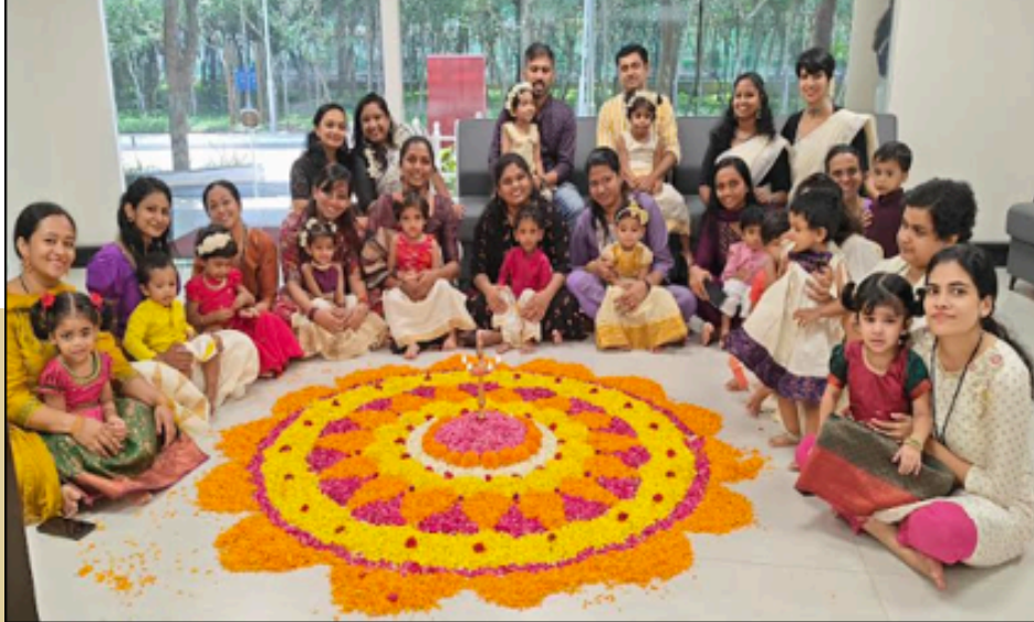
Attapookkalam at Infosys

At Infosys , tradition and warmth blended beautifully as children, parents, and staff joined hands to create a colourful Attapookkalam . The young ones showcased their talent with a graceful Thiruvathira , enjoyed games and music, and savoured the festive Sadya . Parents, dressed in traditional attire, added to the cultural charm, making the celebration even more memorable.