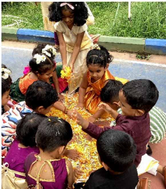
Pookalam in the making