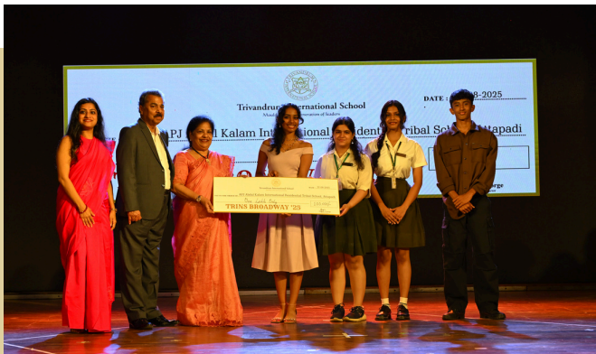
A.P.J. Abdul Kalam International Residential Tribal School, Attapadi

TRINS Broadway 2025 was a grand showcase of student talent, creativity, and teamwork — a colourful inter-house drama competition that brought together music, dance, and theatre on one stage. Beyond the spotlight, it was also an evening of compassion, with funds raised through ticket sales donated to: