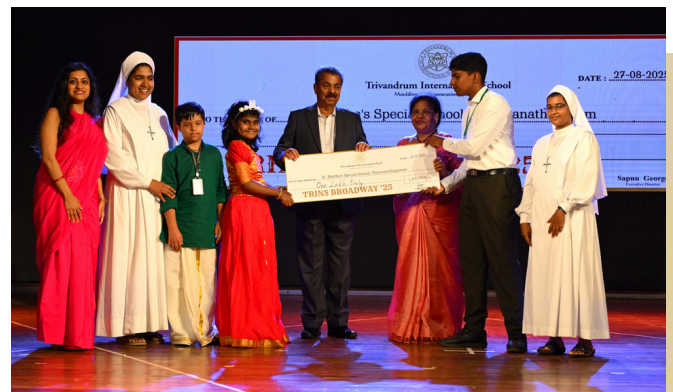
St. Martha's Special School, Thiruvananthapuram