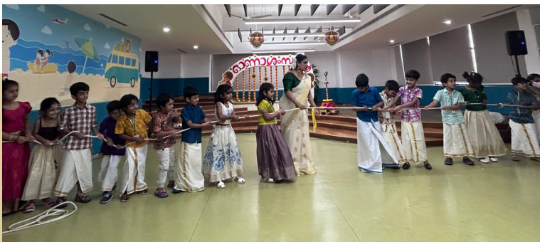
Vadamvali (Tug of War) at ELC Technopark