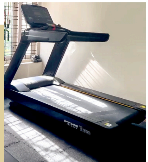
TRINS Fitness Centre