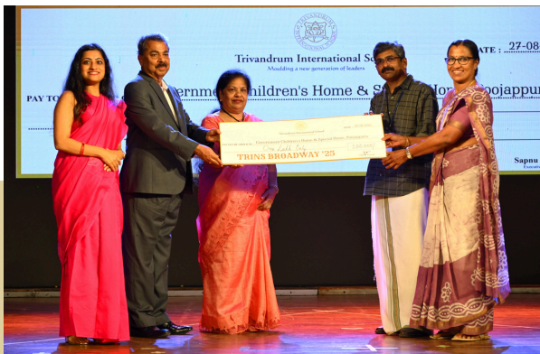
Govt. Children's Home and Special Home, Poojappura

The evening began with a speech from our leadership and warm welcome addresses, setting the stage for four spectacular one-act adaptations by the houses— Agni, Jalam, Vayu, and Prithvi.