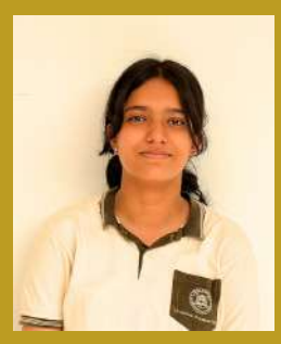
Gourika 10 IG