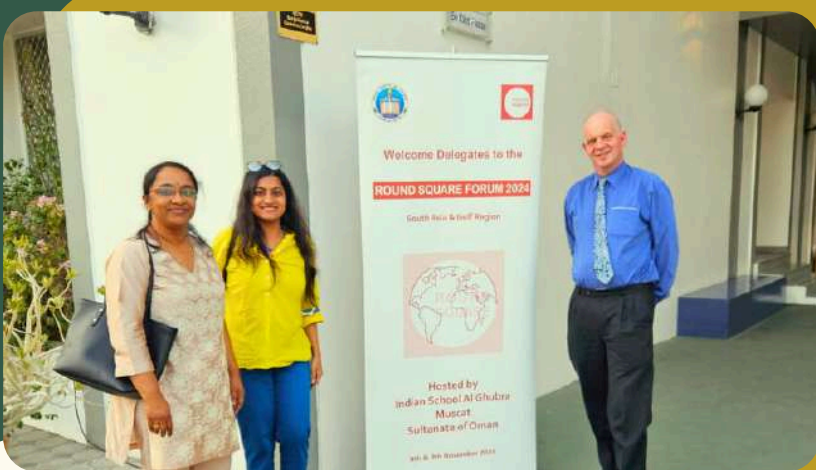
Attending the Round Square Regional Annual Meeting in Muscat, 8th-9th November 2024