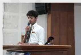
RAGHAV VINISH ASTROPHYSICS (BOOK)