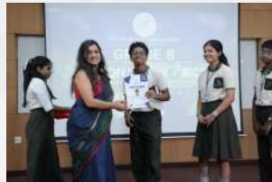
THE IMPORTANCE OF INVESTING IN ASSETS: UNDER FOCUS OF THE STOCK MARKET