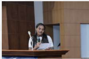
BRAHMA MS VISWASAKTHI EVOLUTION OF CARS