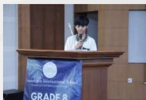
IARIN REJI THERE IS ABILITY IN DISABILITY