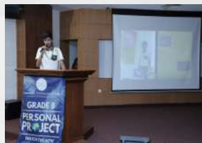
VOJTECH FASANEK CHESS: HISTORY, PSYCHOLOGY & TACTICS