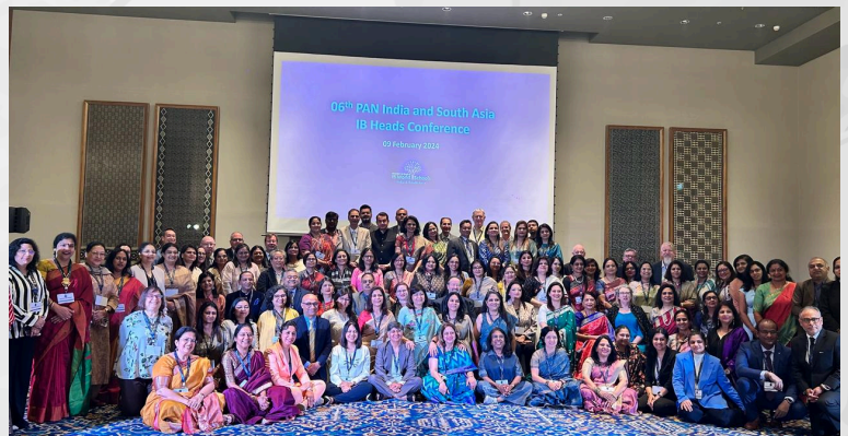
Pan India and South Asia IB Heads Conference, Kolkata